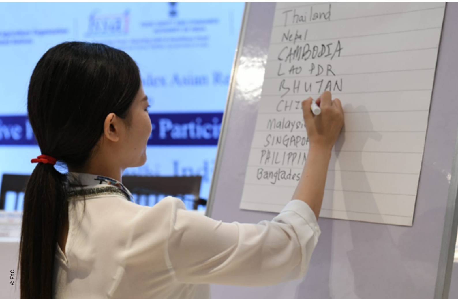
17 countries meet in India for Codex online tools workshop - 2018